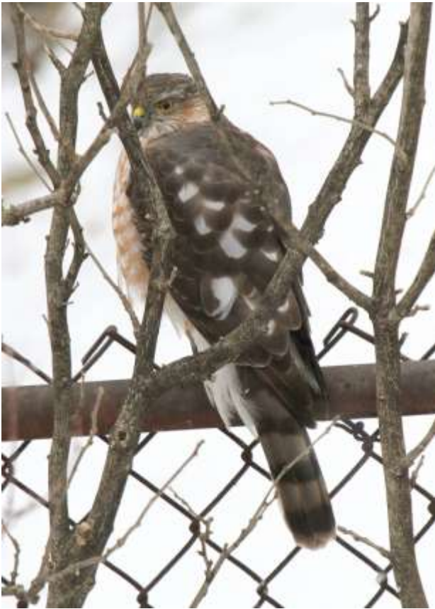
Finally, the Sharp-shinned Hawk stirred from its torpor.