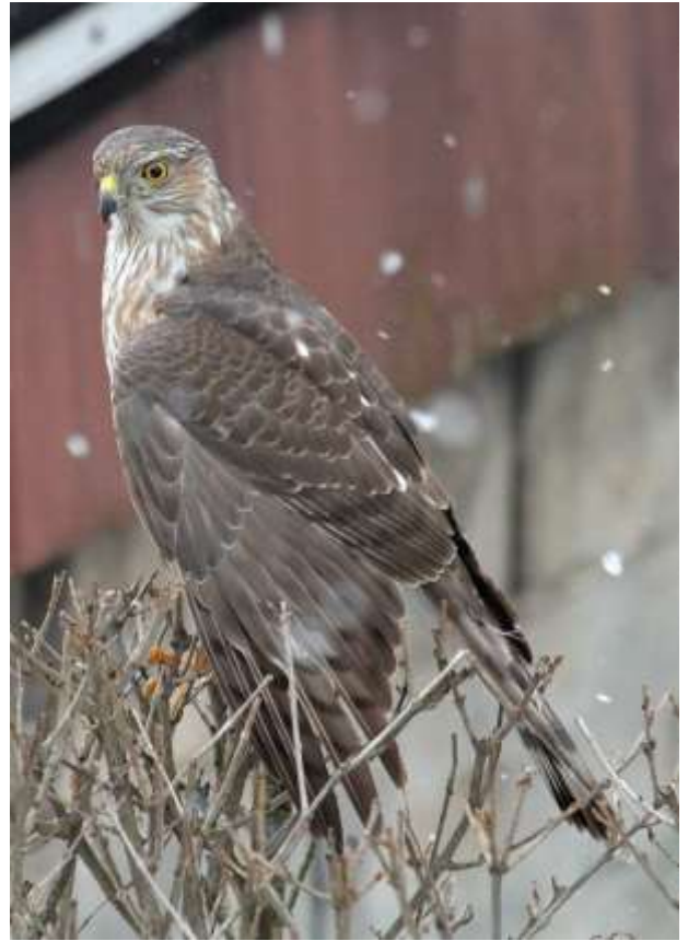
The hawk moved from the back fence to the back hedge..