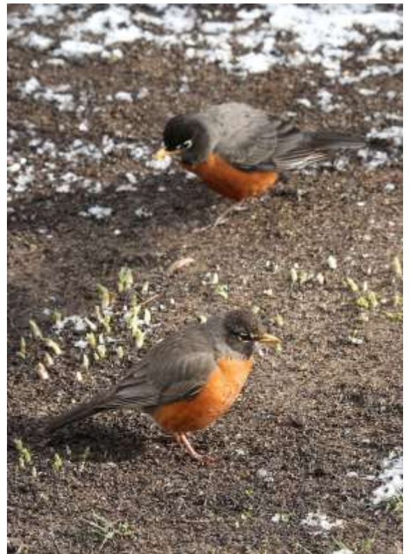
Two male Robins got along well with each other for over six weeks. Then a female arrived...