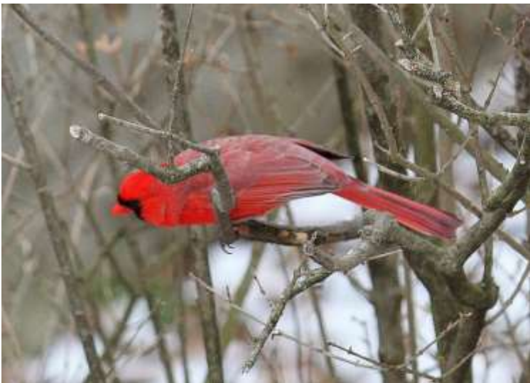
‘Our’ male Cardinal spied a rival and soon forcibly evicted him from the yard. The action was too fast for photos!