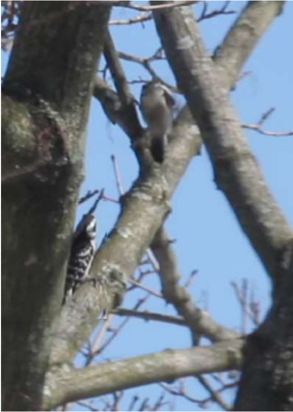
Two Downy Woodpecker females confront one another over territorial limits.