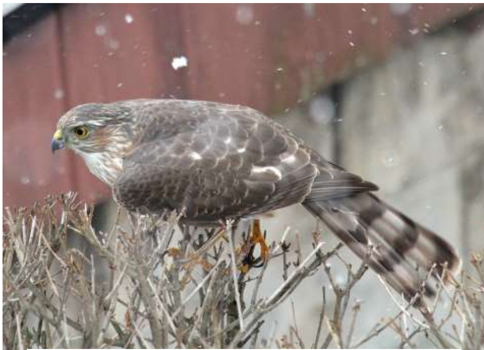
There the hawk spied its target, and the next second it attacked!