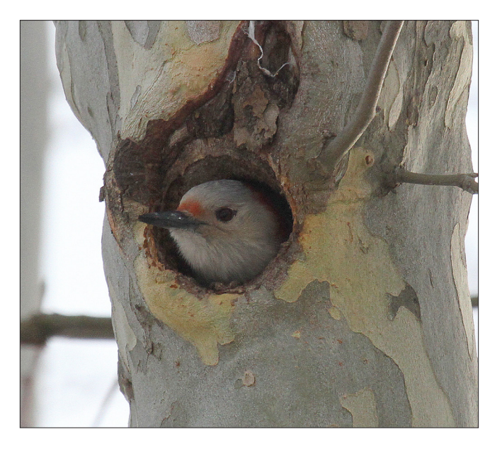
SNUG QUARTERS – The Red-bellied Woodpecker uses a carefully constructed hole for its winter home. It digs the hole downward in the trunk for winter protection. Tom photographed it in Squirrel Hill on December 14, 2016.