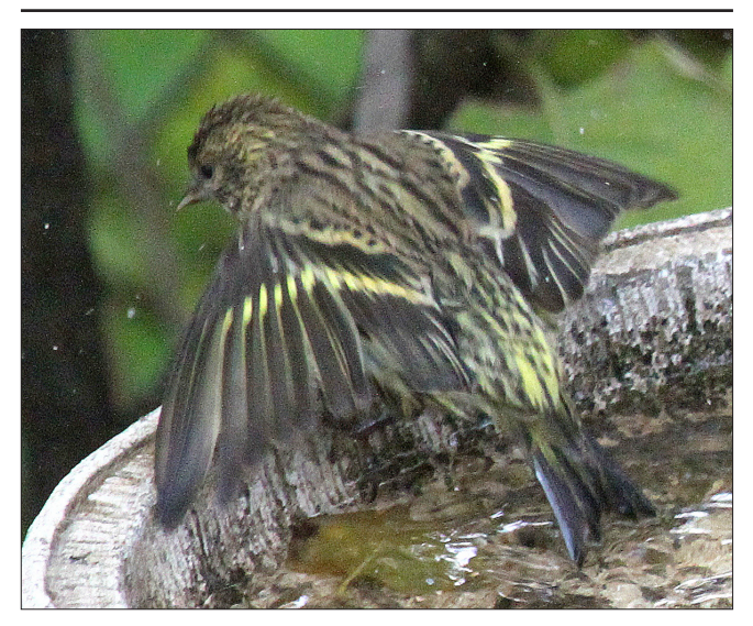
BRIGHT WINGS – We usually get only a quick glimpse of a Pine Siskin's bright yellow wing bars in flight. Tom Moeller's fast camera work gives us a leisurely look at one at his feeder in Pittsburgh on November 3, 2018.

Please check The Peregrine , Facebook, and our website for details as we move forward.