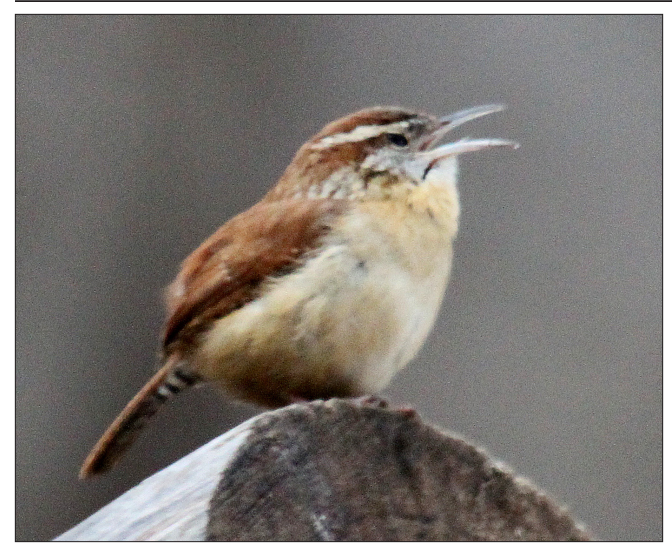
MUSICAL WELCOME – Well, this Carolina Wren wasn't exactly welcoming birders to the "Dead of Winter" outing at Frick Park, but he brightened a cloudy day. These wrens sometimes sing all winter, perhaps protecting territory, maintaining year-round pair bonds with mates, or for something else we don't yet understand. Maybe something like "enjoyment"?