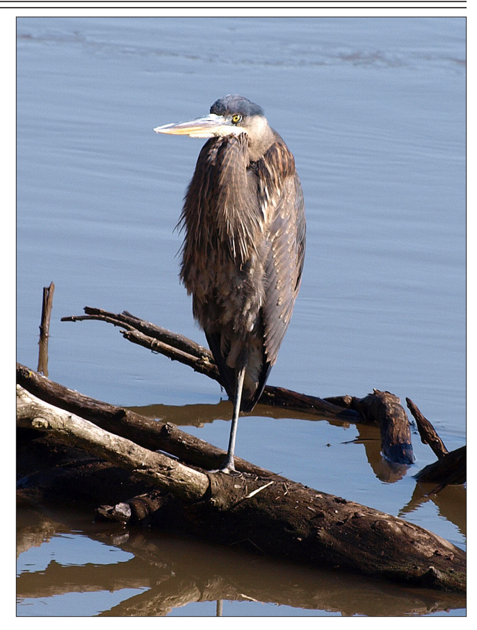
COLD COMFORT – Tom Moeller explains three ways this Great Blue Heron keeps warm: Its neck is retracted, only one leg is exposed to the cold, and it folds its wing as a cozy cloak. Tom photographed it at Duck Hollow on March 7, 2011.

Ruffed Grouse dig holes under the snow to hide from wind, cold, and predators. These birds can break through the ice formed if snow may melt and refreeze over their heads. Smaller birds would be trapped. Normally ground feeders, grouse find food in a snow-covered landscape: buds in trees. Grouse fly up into aspens, poplars, or birches, stuff their crops with enough food to digest for