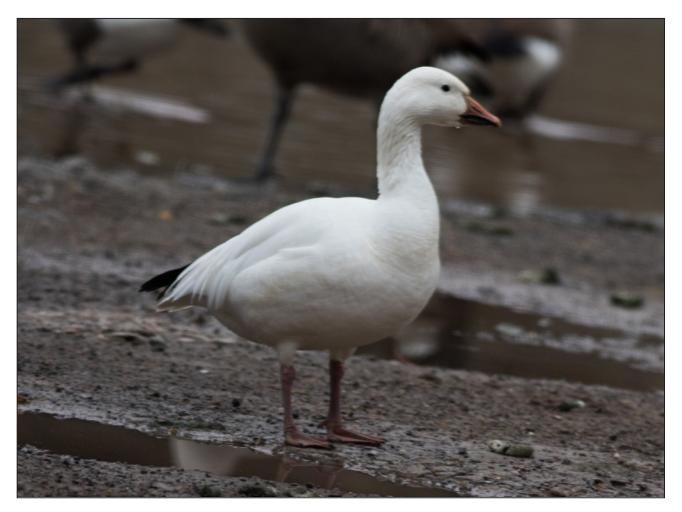
RARE VISITOR – A Snow Goose at the Allegheny Cemetery in Lawrenceville was a highlight of the Pittsburgh Christmas Count.