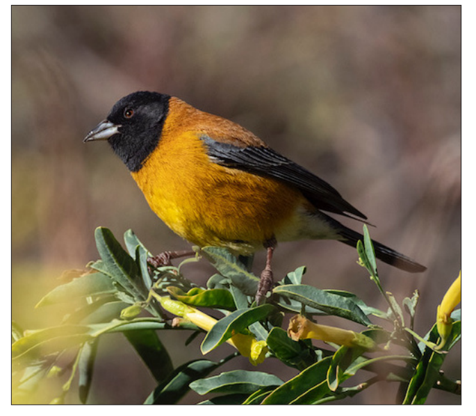
BLACK-HOODED SIERRA-FINCH – As its Sierra name indicates, this is another high-elevation species, and it is not in the finch family we know. It is a member of the huge, remarkably diverse family of tropical tanagers.