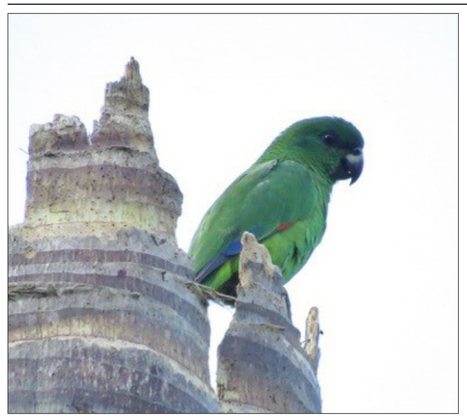
BLACK-BILLED PARROT – Like the Jamaican Tody, this species is endemic to the island.