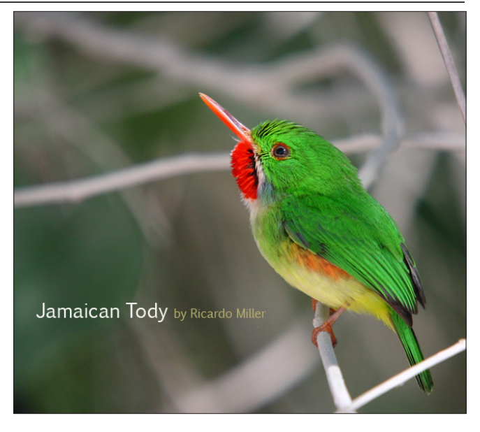
TINY AND DAZZLING – An avian icon on Jamaica, the little multicolored Jamaican Tody is endemic to this island; that is, you will not find one anywhere else in the Caribbean.