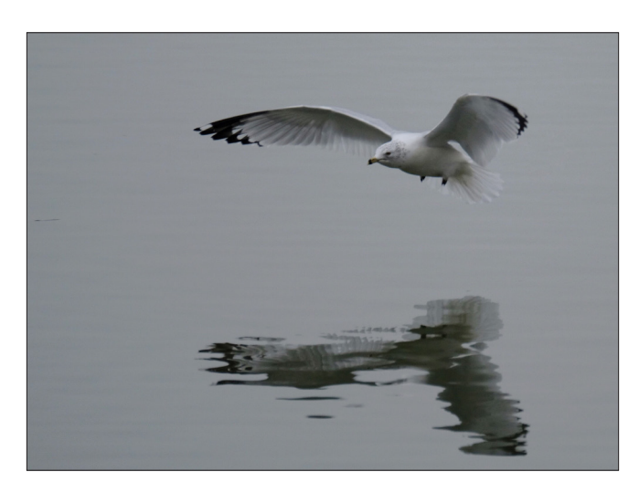
READY FOR TOUCH-DOWN — On a cloudy day and with calm water on the Mon River at Duck Hollow, a Ring-billed Gull prepares to land. Note how the outer primaries curve downward, just as a pilot lowers an airliner's flaps, to slow the bird carefully for a soft landing.

Thanks to Ricardo's expertise, we saw 111 species including all 29 Jamaican endemics and 10 other life birds.