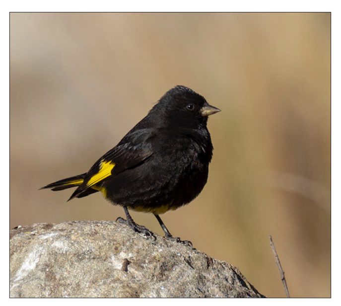
BLACK SISKIN – Claire mentions the "mind-boggling" variety of finch species she saw in Argentina. This high-elevation species is a fairly close relative of our North American Pine Siskin – both are in the same genus named Spinus.